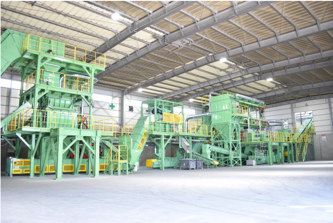
RPF production facility