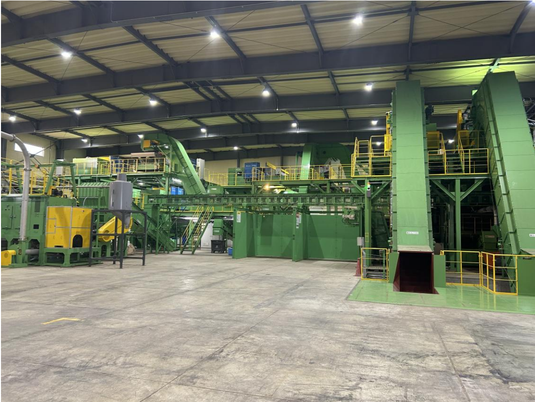
Advanced plastic sorting facility