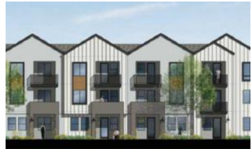
Artistic rendering of the completed

With a total of 302 units, this multifamily residential complex features three- and four-story apartment-type buildings and three-story townhome-type buildings. Residents can enjoy a large, resort-like pool and spa, along with a fully equipped outdoor kitchen and modern furniture for poolside meals. The property also includes a barbeque deck, a pet spa and grooming facilities, co-working spaces, a gym with a kids' room, and other common facilities to provide a comfortable living space.