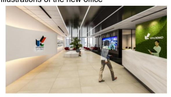
14th floor general reception area