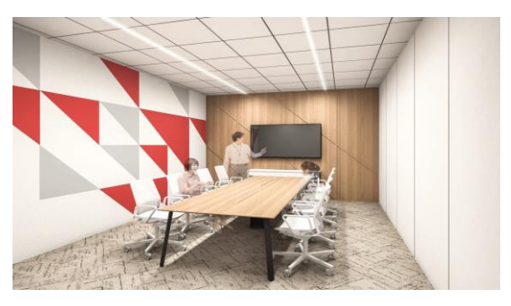
14th floor conference room evoking Kyushu festivals