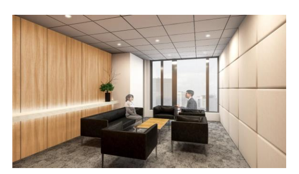
14th floor reception room featuring incombustible lumber from tree-thinning