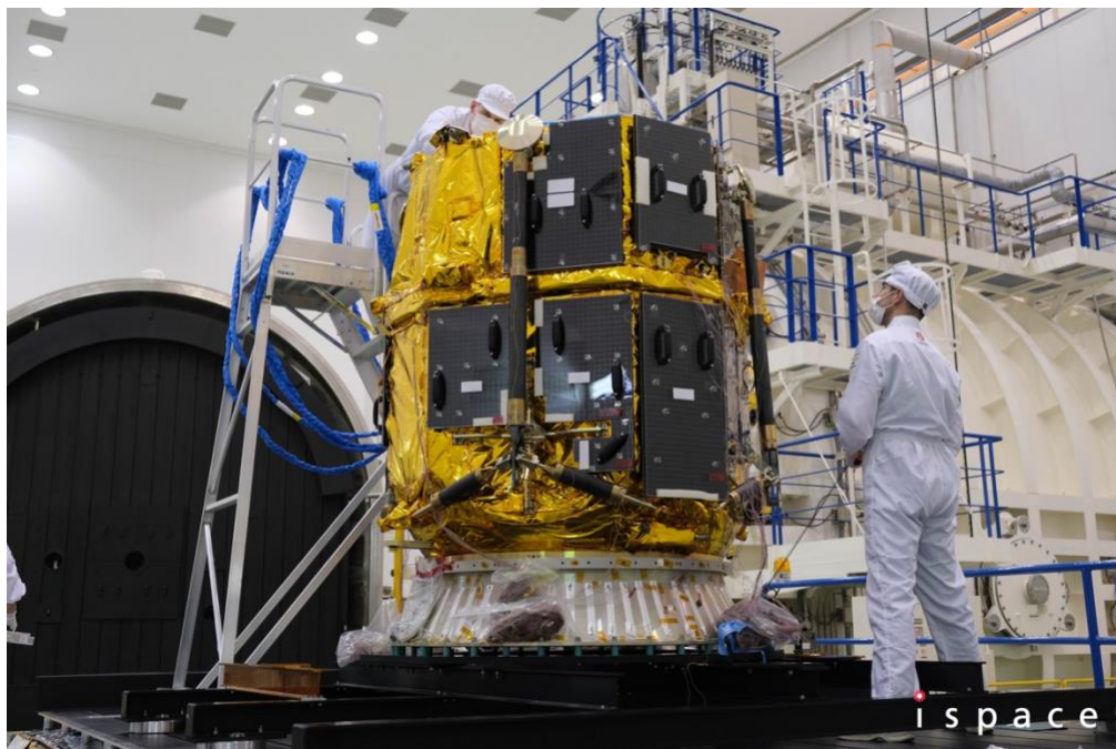
ispace engineers preparing the Resilience lunar lander for testing at a JAXA facility in Tsukuba, Japan.

TOKYO – June 27, 2024 – ispace, inc. (ispace)( TOKYO: 9348 ), a global lunar exploration company, announced today that the flight model of its HAKUTO-R Mission 2 RESILIENCE lunar lander has successfully completed thermal vacuum testing and remains on schedule for a Winter 2024 launch.