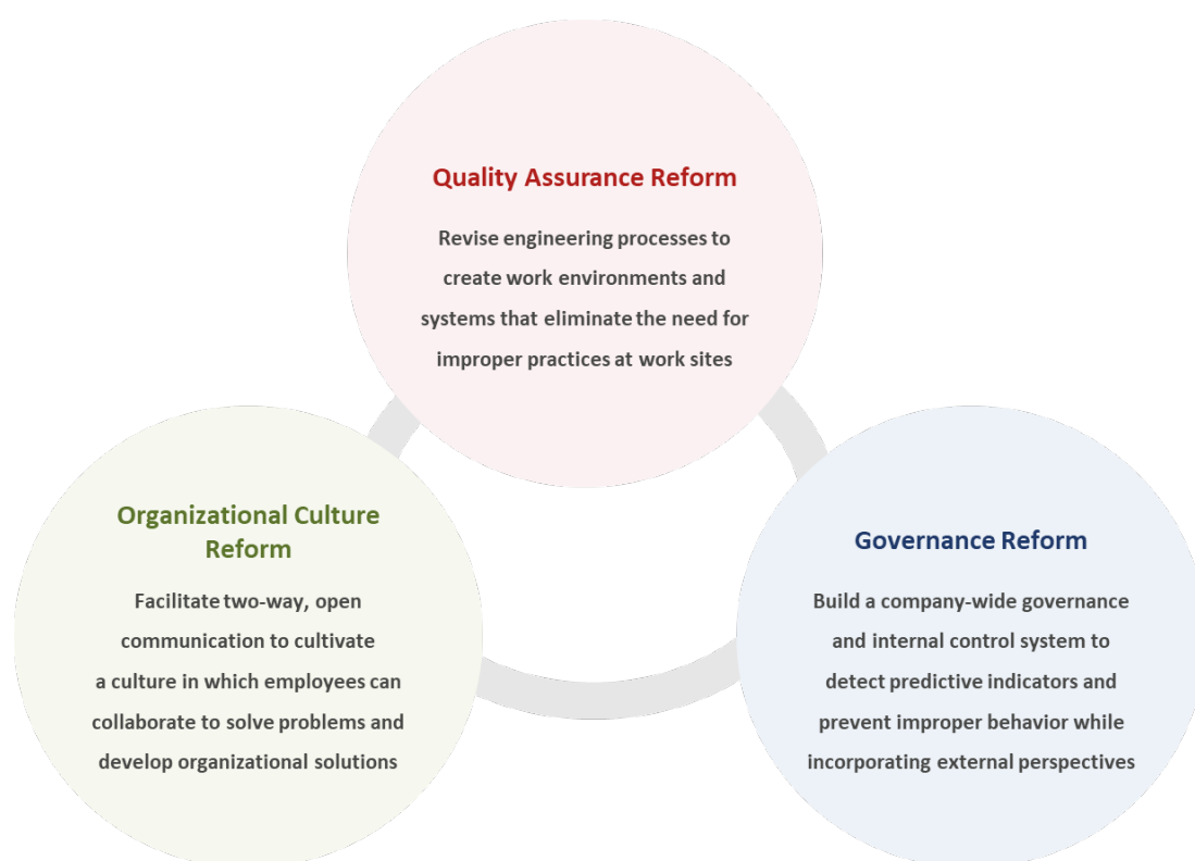
Overview of the Three Key Reforms

In collaboration with the company-wide transformation project, the Company will make every effort to transform itself towards creating a new Mitsubishi Electric by enhancing and developing the Three Key Reforms of quality assurance, organizational culture, and governance.