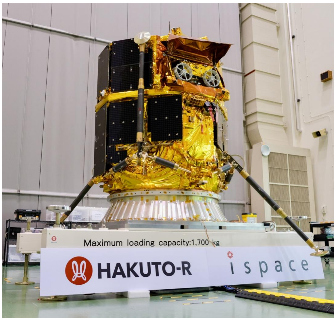
An image of ispace’s RESILIENCE lunar lander at a JAXA facility in Tsukuba, Japan.

TOKYO – September 12, 2024 – To mark Japan’s national Space Day, ispace, inc. (ispace) ( TOKYO: 9348 ), a global lunar exploration company, announced today that its Mission 2, featuring the RESILIENCE lunar lander and TENACIOUS micro rover, is now planned to launch no earlier than December 2024.