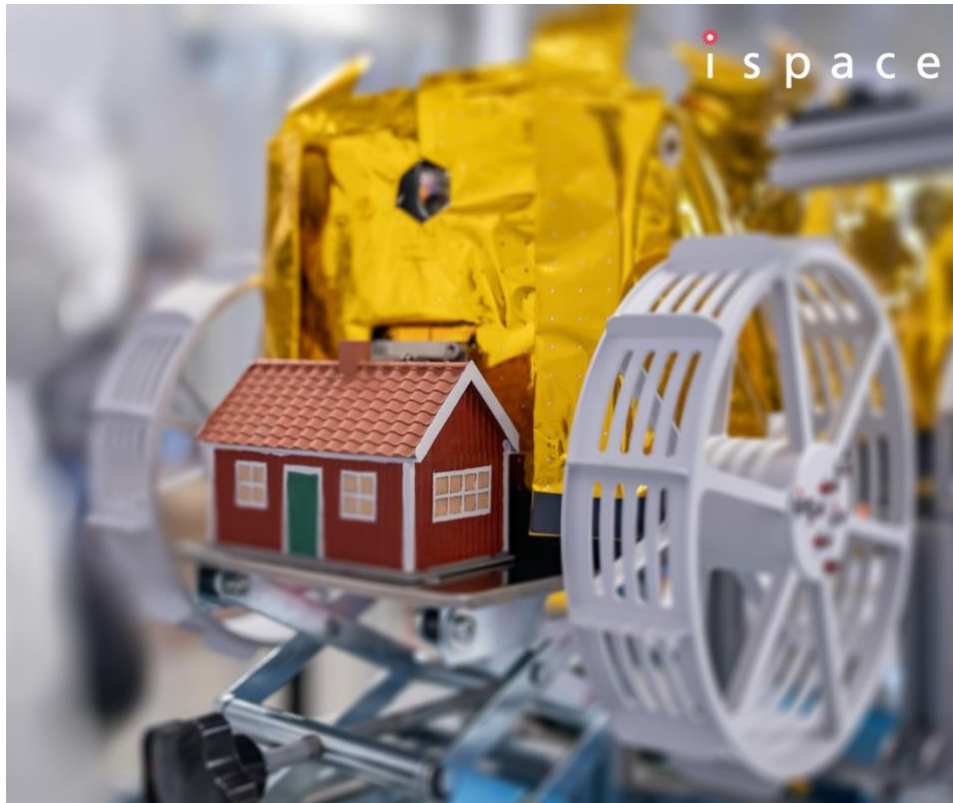
Pictured is the Moonhouse mounted on ispace’s TENACIOUS lunar micro rover being prepared for HAKUTO-R Mission 2.